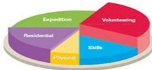
The Volunteering section came out top in helping participants prepare for the working world.

Participating in DofE activities has given nearly \frac{1}{4} some ideas for their future career.